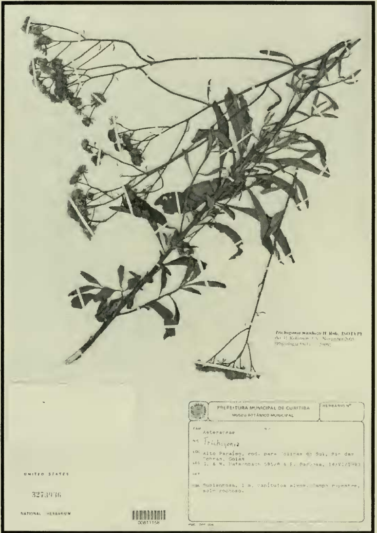
Fig. 7. Trichogonia munhozii H. Robinson, isotype, United States National Herbarium (US).